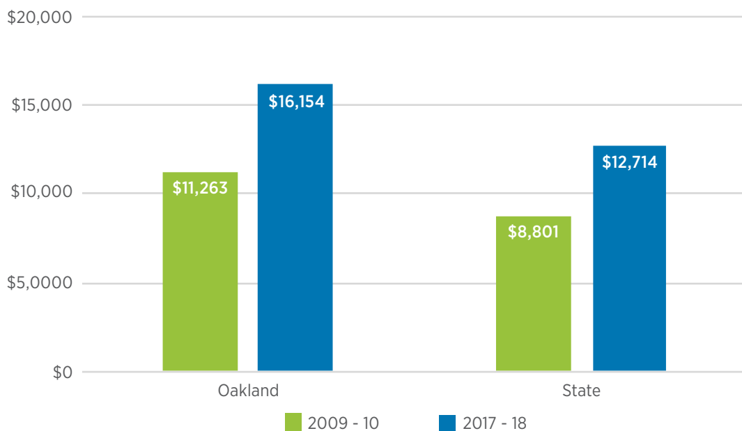
FIGURE 2. Per-Pupil Revenues Are Up 40 Percent in OUSD Since 2009–2010